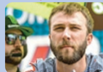
TOMAC Eli CO - Kaw

26/05 CA Pala 1-1 16/06 PA Mount-Morris 3-2 07/07 MI Buchanan 1-2 28/07 WA Washougal 1-1 18/08 MD Budds-Creek 1-1 25/08 IN Crawfordsville 3-1 6 v